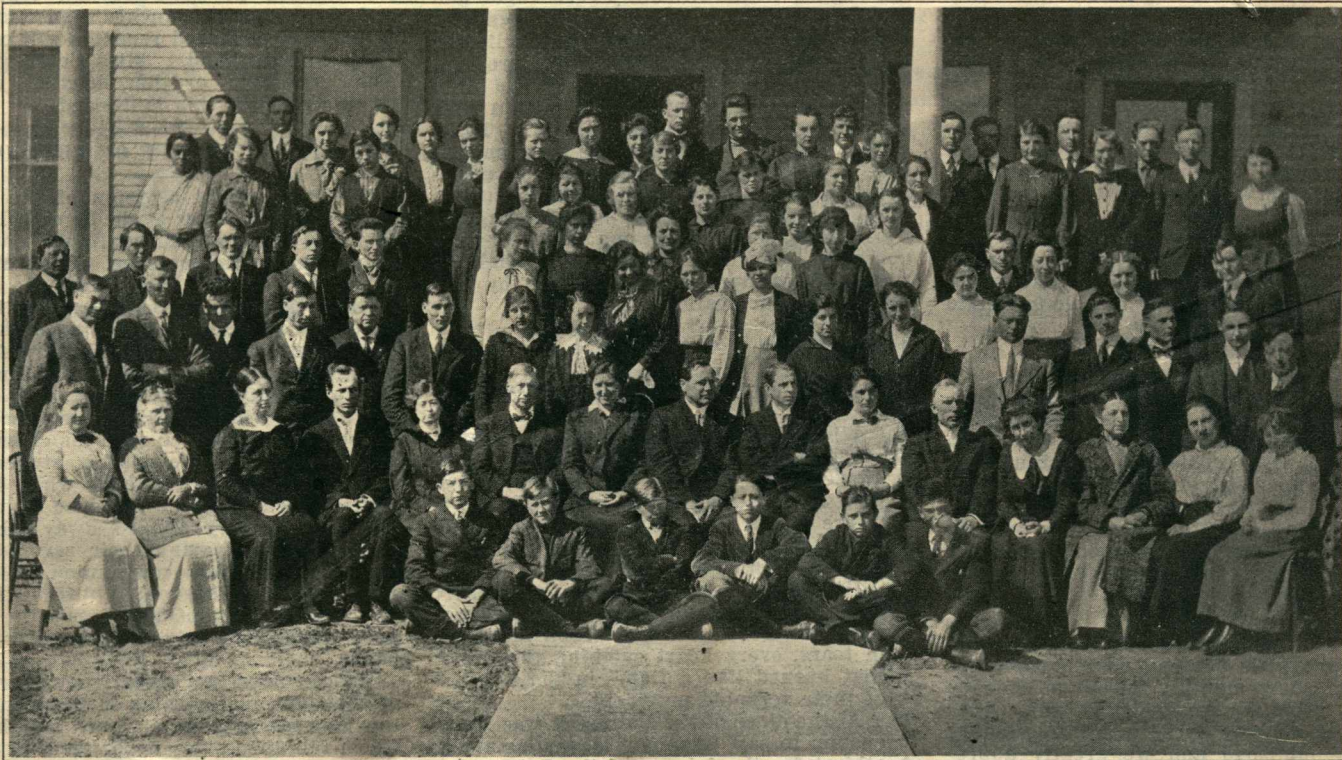
FACULTY AND STUDENTS