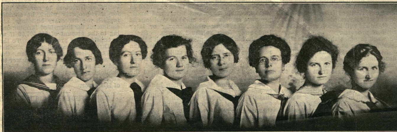
GIRLS' GLEE CLUB

Lord send us the glory! Let it roll over us like mighty billows, let the heavens bend low and the mountains flow down at thy presence, and let the very atmosphere be charged with the heavenly aroma. Let it break up all formality and lip service, let it spoil our niceness and false respectability, humble our pride, ruin our reputation with the world and worldlings, burst forth in shouts of holy joy, ripple over us in holy laughter, break out in fiery exhortation and send us to our knees in agonizing prayer,—yes Lord if a hundred pray at once and pray for an hour. Let it shine forth with such brightness as to send pharisees to their knees in the dusty highways and unhorse sinners in the middle of the big road. Let it spoil laziness around the altar and set sinners to praying and fasting; let it cure superficial daubing with untempered mortar and give courage to put in the probe until all sin is surrendered. Let it reveal carnality and crucify it, let it stir up the devil and cast him out. This is our prayer,—this we must have. We cannot live without it. Regardless of consequences and with holy recklessness we still pray, Lord send us the glory!