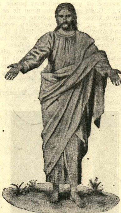
Jesus, the Nazarene

The title "Nazarene" as applied to our Saviour takes on a deeper significance when viewed in the light of prophetic teaching. There is a divine as well as a human significance. As the cross of Jesus marked at once the fathomless depths of divine love and the bitter and undying hatred of a sinful world, so the title "Nezer" as applied to Jesus has a twofold meaning,—it is both friendly and inimical. In the eyes of the world, Nezer was but a contemptible shrub, and the "Nazarene" a "shrub from the 'town of shrubs.'" But