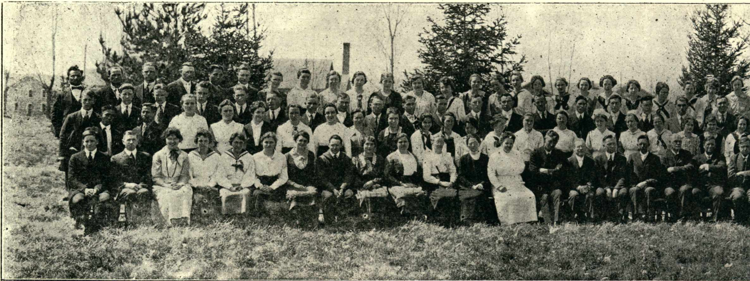
College, Academy, Bible Students and