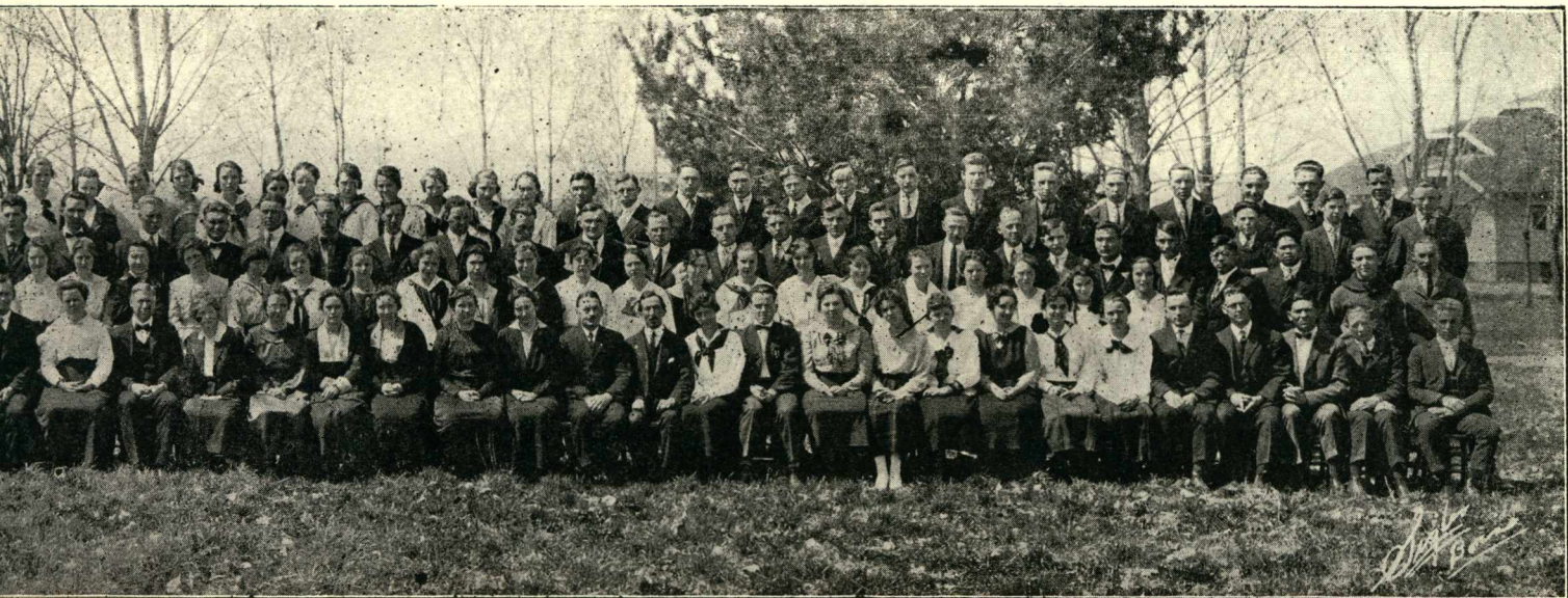
Faculty of Northwest Nazarene College

our other interests such as our Publishing House and our schools which are in need of strong financial support. With out the churches these can not run.