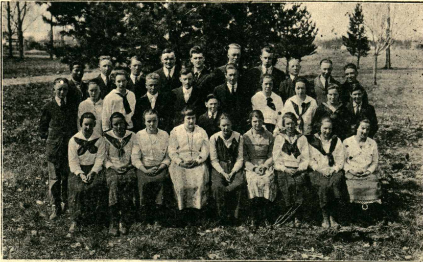
Academy Freshmen, 1922