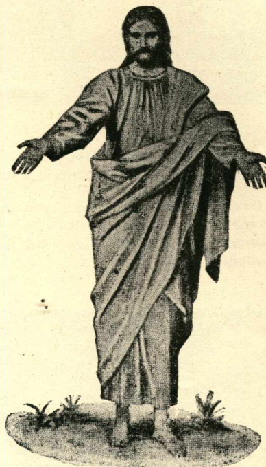
The Nazarene "Learn of Me"

The mind is clearest and most alert in the morning hours. It is then that men do their best thinking. This early hour should at any sacrifice be secured for the instruction of the great Teacher. It is the Master's hour and should be spent in His presence for personal edification.