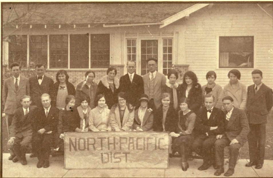
Students From North Pacific District

About 30 in 1928-1929; why not 50 in 1929-1930? Why not lead this year with the largest representation except the Idaho-Oregon?