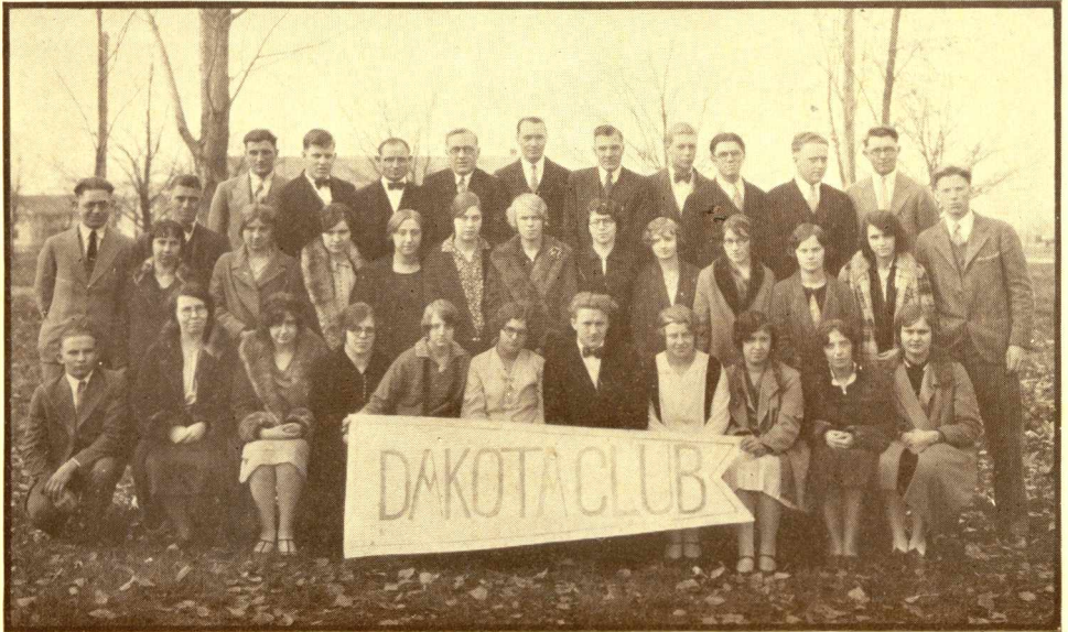
Students From the Dakotas

About 25 in 1928-1929; why not 40 in 1929-1930?