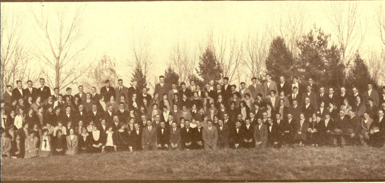
Christian Workers' Band of Northwest Nazarene College