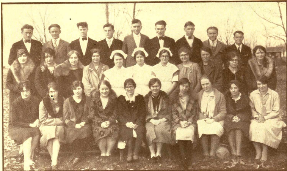
Foreign Mission Band

ORTHWEST CT ong in 1928- two dozen 930? UNTAIN CT 8-1929; why 29-1930? 27-1928.....317 28-1929.....389 increase.