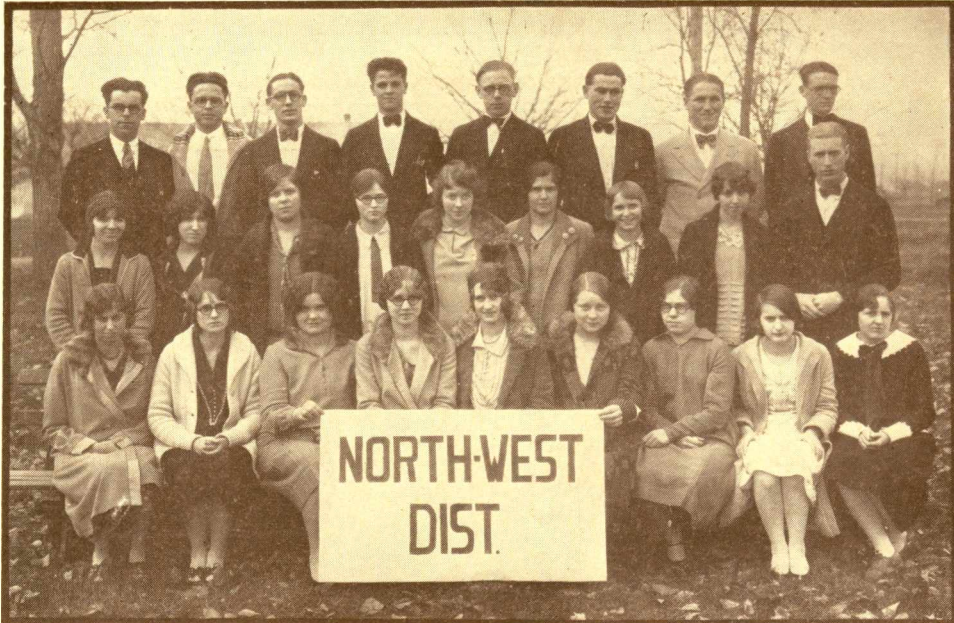
Students From the Northwest District

About 30 in 1928-1929; why not 50 in 1929-1930? Why not lead this year with the largest representation except the Idaho-Oregon?