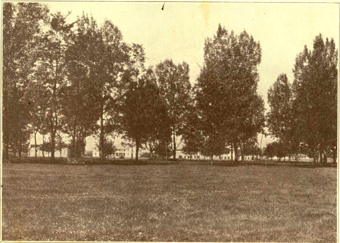
View of Campus and Buildings from Kurtz Park.