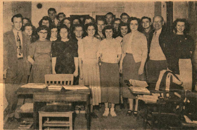
Members of the Music Department and several of the music instructors are pictured above.