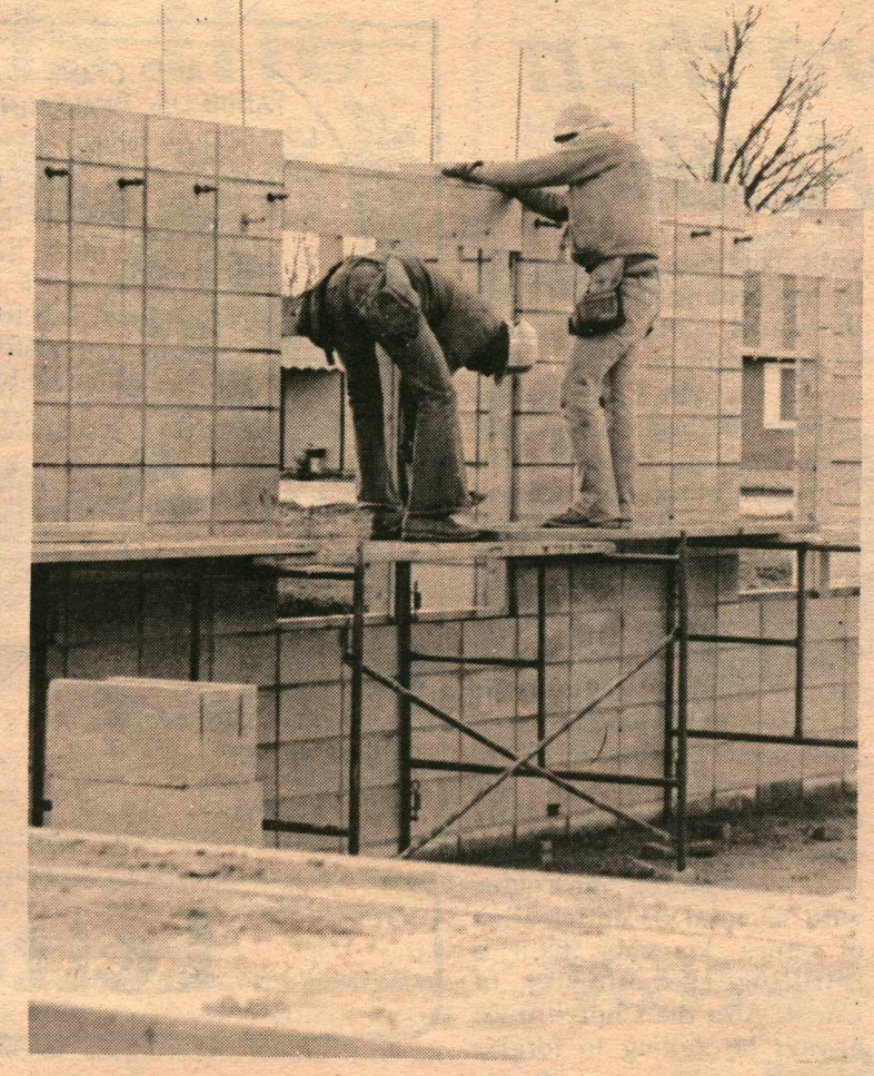
Benefiting from the great weather recently, construction of the new housing complex is back on schedule and should be ready for fall students

The cards were apparently still in proper sequence and no substantial amount of work was required to return them to working condition.