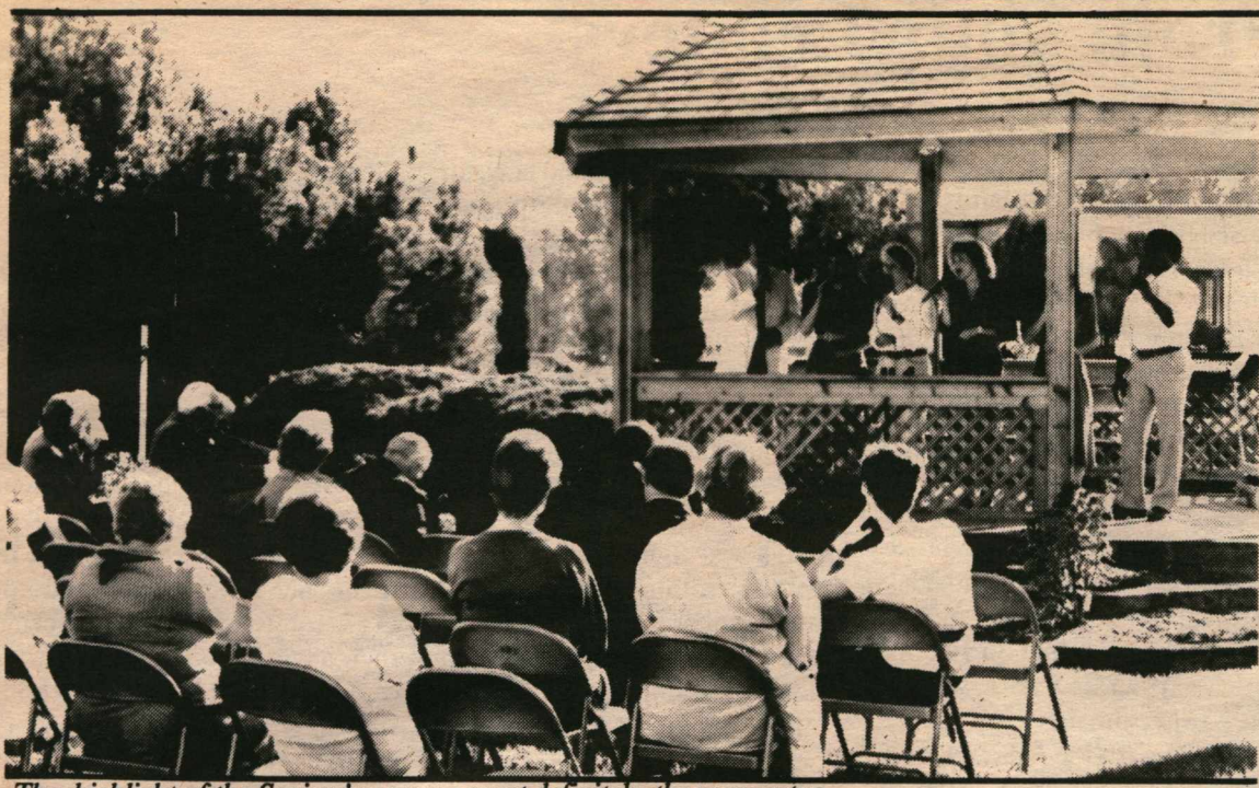
The highlight of the Seniors' year was most definitely the momentous dedication of the gazebo.