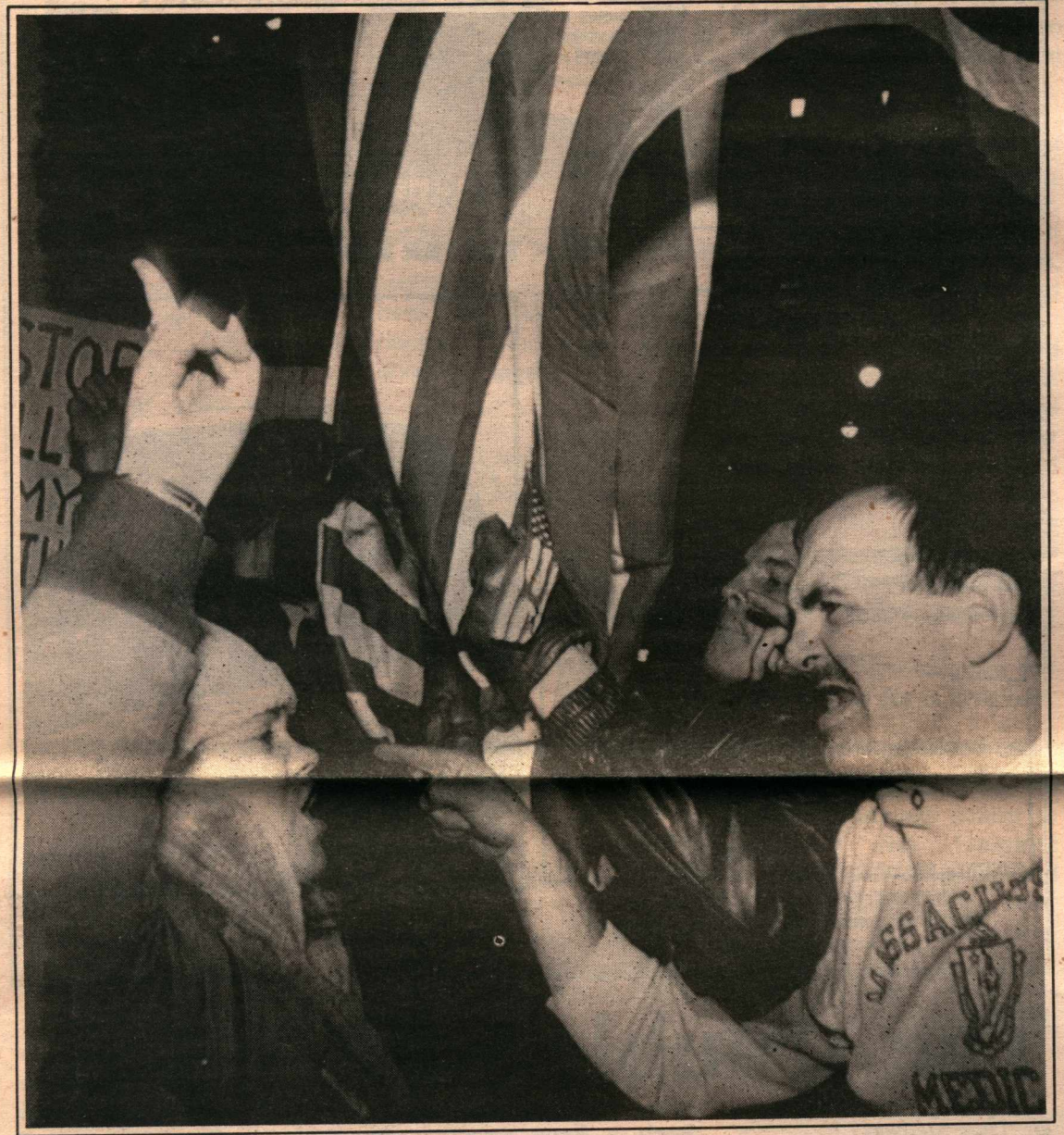
An anti-war demonstrator in Boston faces off against a supporter of U.S. troops in the Persian Gulf. Approximately 600 anti-war marchers argued with around 60 people supporting the war and the troops.