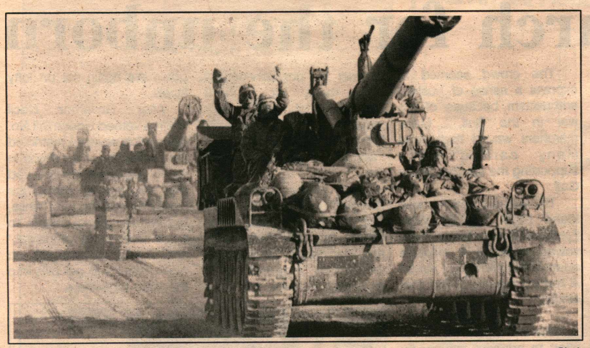
American Troops move in closer toward the Kuwaiti border to prepare for a showdown with dug-in Iraqi forces.