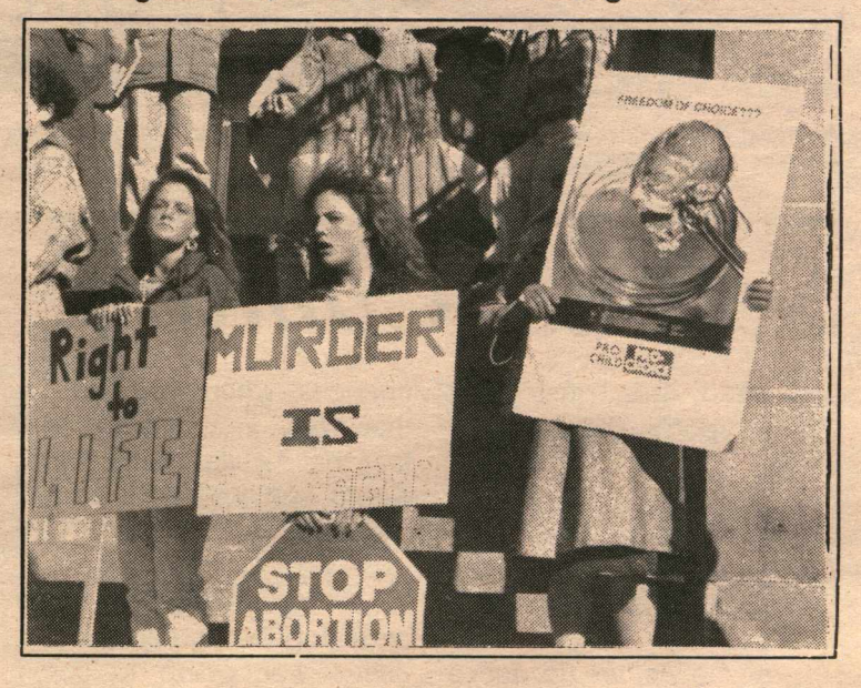
Most Pro-life activists carried fairly subdued signs in protest of Abortion. However, this sign expressed a more eye-opening view.