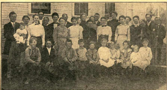
1913 The Faculty and Student-Body