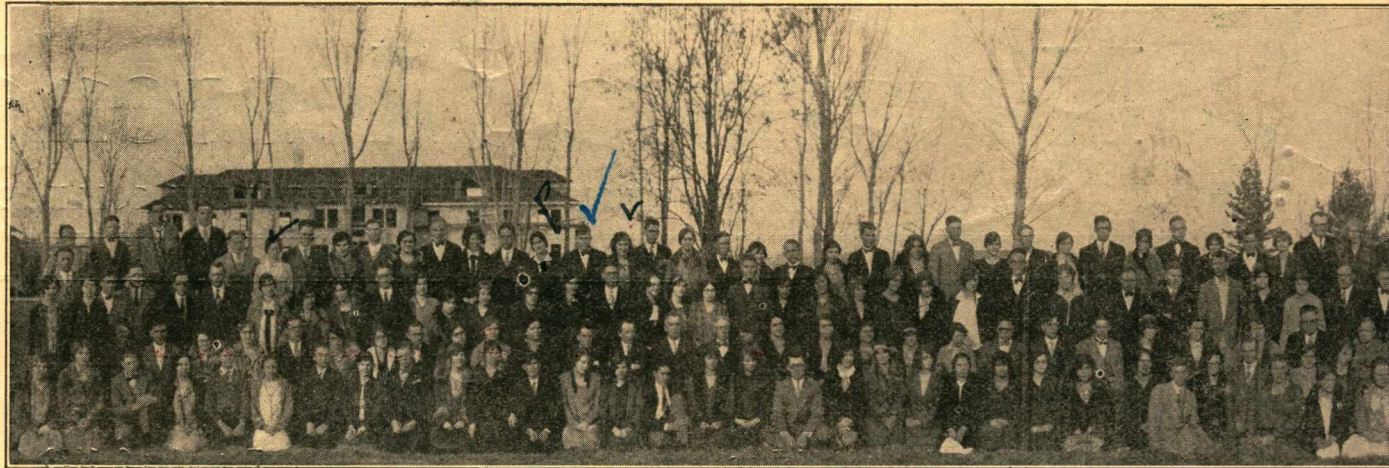
The Board of Directors, Faculty and Student-Body of