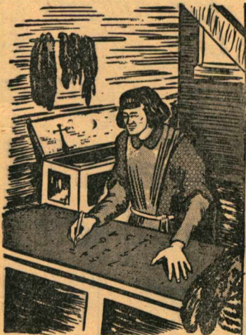
By RAY MIX

COUNTER — Tradesmen of Medieval Europe calculated the prices of their wares upon the top of the table which separated them from their customers. This practice was called "counting" and the table became a — COUNTER.