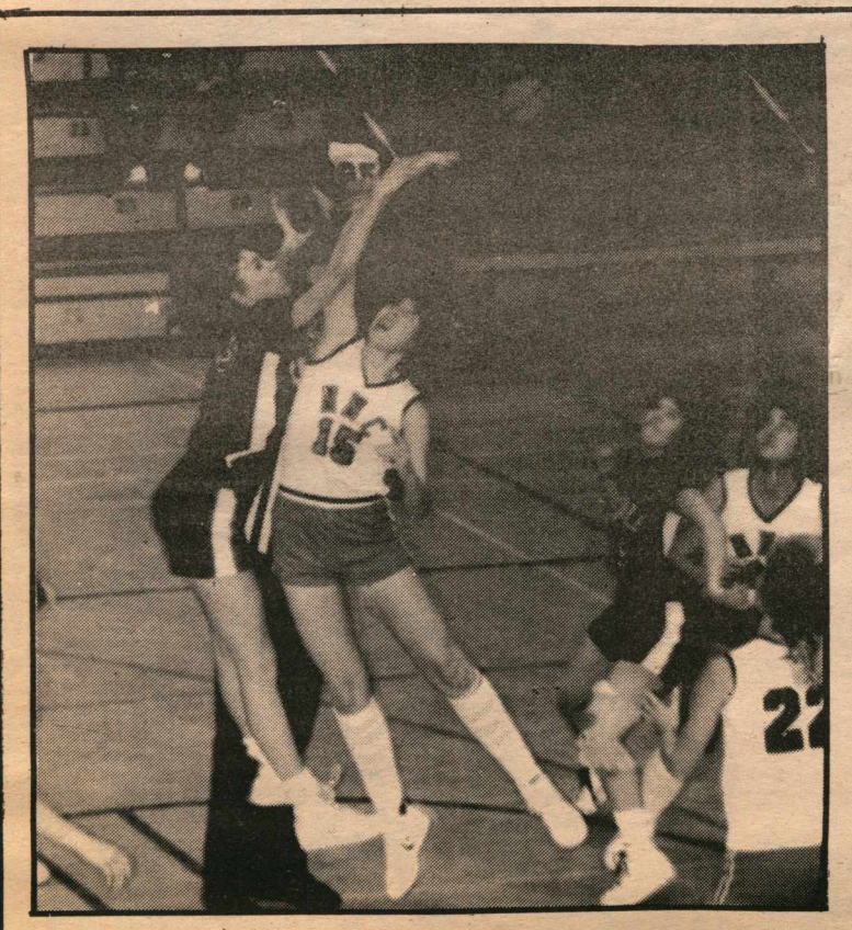
Intense action during a recent women's basketball game.

NNC's women's basketball team split their last four home games of the season to give them a final regular-season record of 13-12, and that earned them a spot in last weekend's Distict tournament in Portland.